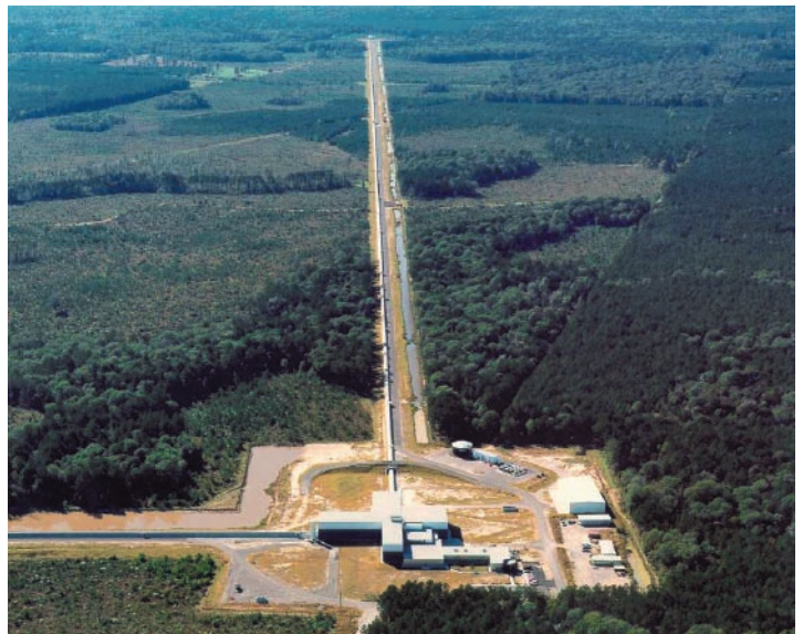
LIGO in Livingston, Louisiana